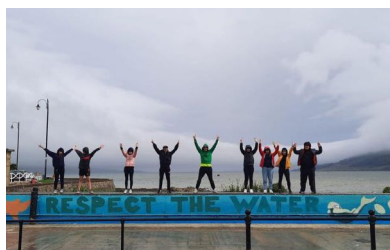
Participants on the Summer Splash Programme.