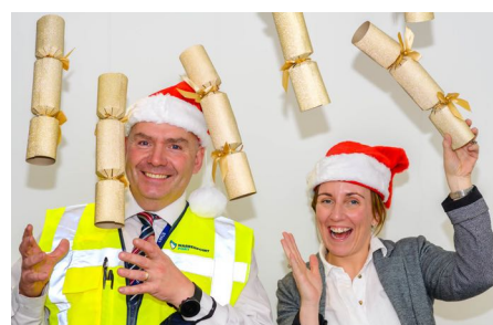
Members of the Warrenpoint Port team are pictured getting into the festive spirit at the launch of the Community Christmas Fund.